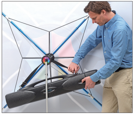
8 Hang the transport case with the shoulder strap on the back hub to add counterbalance to the display.

7 Pull hub away from the graphic to stretch the system to complete setup.