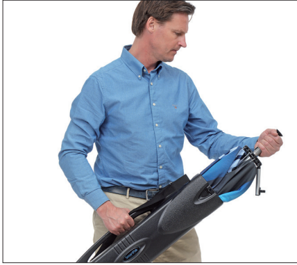
Take out ShowFlex from the bag/case and set it upright on a table/on the floor.

Watch the ShowFlex assembly video on our website for a more detailed instruction.